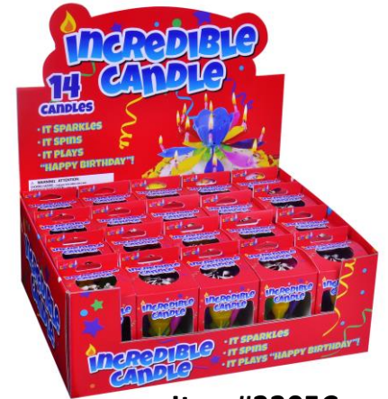
Item#3305C 20 pc CDU