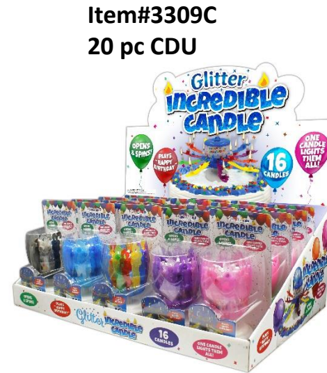
Item#3309C 20 pc CDU