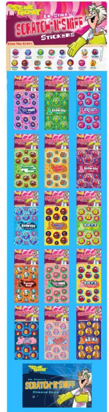
150 pc FD