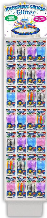
Item#3309F 56 pc FD