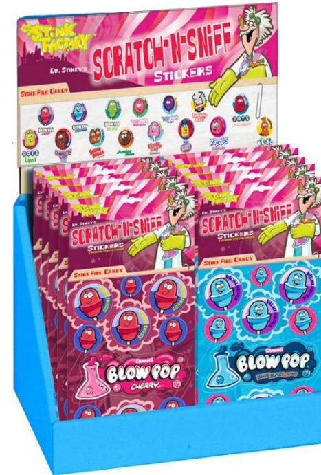
60 pc CDU